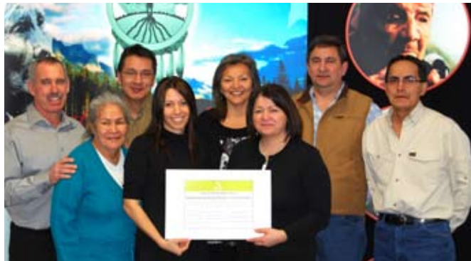
Council of Western Treaty 8 Chiefs

The Council of Treaty 8 Chiefs signed a framework Protocol Agreement with Northern Gateway in mid-August of 2008.